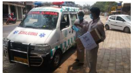
YHAI Feorke Tile City Unit (Kozhikkode)