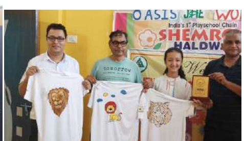
Painting prizes distribution event held at Shemrock World School