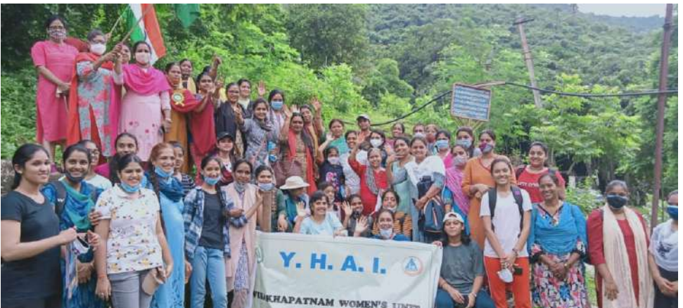
Women's Trekkers Group photos at Madhavadhara