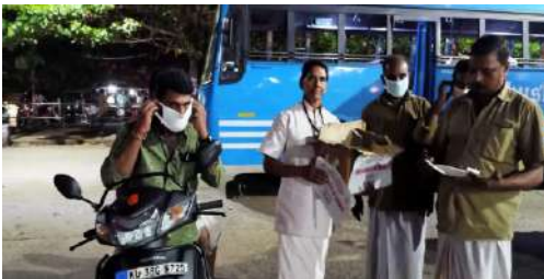
YHAI Idukki @ Thodupuzha