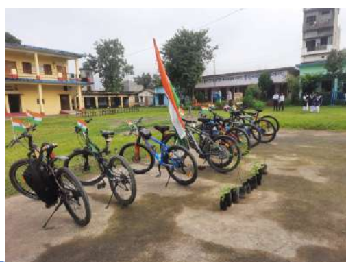
Cycling for Social Cause