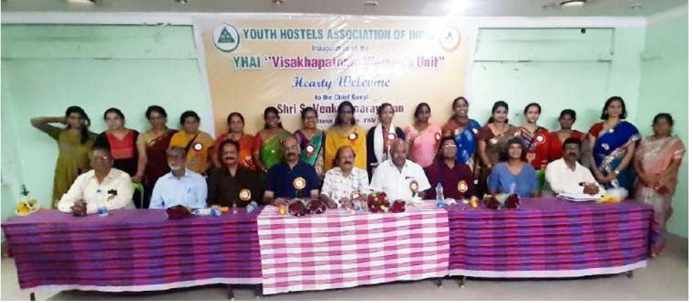
Group Photos of Visakhapatnam Women's Unit