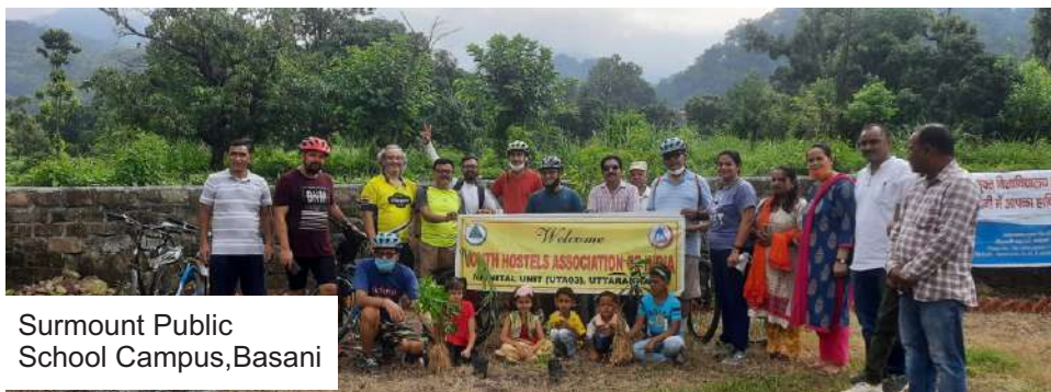
Surmount Public School Campus, Basani

Finally Unit has got five MTB Cycles for the promotion of YHA activities in the region/district.