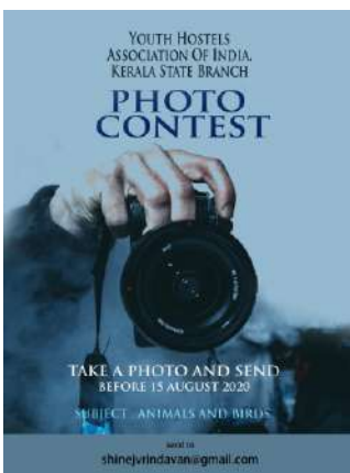
Photo Competition 2020

YHAI Kerala State Branch organized a National Photography Competition. We got 150 entries for the competition. Following are the Winners