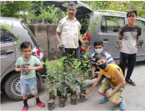
Plantation on 75th Independence Day (15th August, 2020)