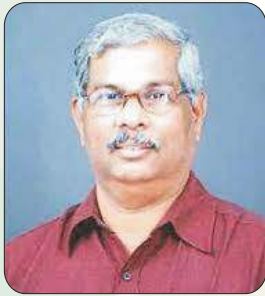
Sh. Rajendra V Arlekar (Hon'ble Governor of Bihar) National President