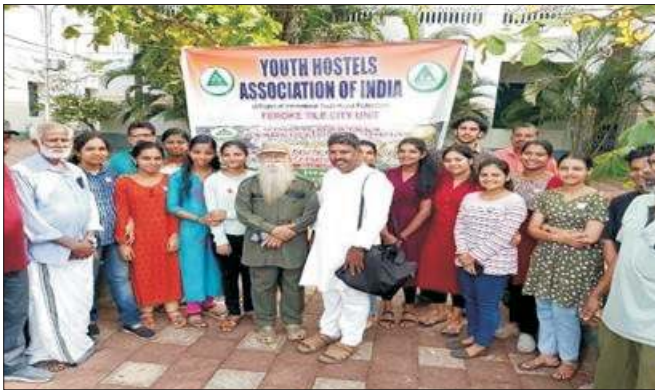
YHAI Idukki Unit celebrated World Environment Day