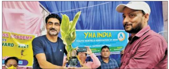
On the occasion of Teachers Day ,5 th September,2023, 7 teachers of various schools of Katihar were honored and certificates and one sapling plant were given to them.