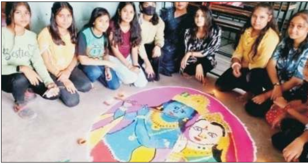
Rangoli competition organised by the unit on 15.8.2023 on the occasion of Independence Day wherein 11 students participated